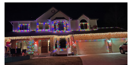
3rd Place: 11142 West Roxbury Place