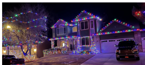
2nd Place: 11026 West Rowland Avenue