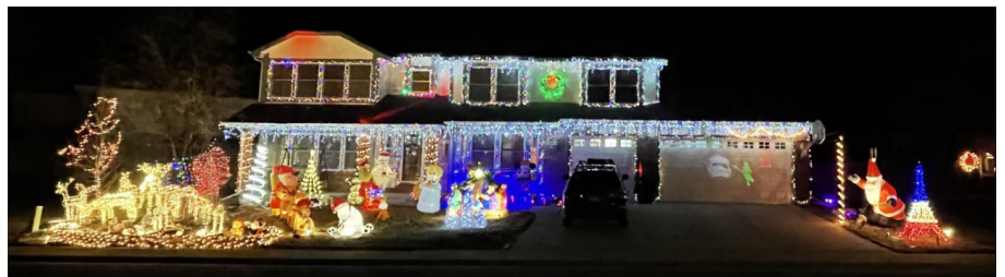
1st Place: 7022 South Robb Street

The neighborhood looked festive again this year. Board members enjoyed driving around and viewing the holiday lights. There were many beautifully decorated homes and it wasn't easy to narrow down to just three winners. But we did. The Woodbourne HOA would like to acknowledge the following winners of the 2021 Holiday Lights Contest . First place goes to 7022 South Robb Street. Second place goes to 11026 West Rowland Avenue. Third place goes to 11142 West Roxbury Place. Honorable Mention goes to the entire West Frost Place cul de sac for 100% participation. Congratulations to all these homes and their beautiful displays and thanks to everyone who decorated their houses this year.