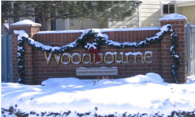
Woodbourne wishes a happy and peaceful 2020 to all.

A Publication of the Woodbourne Homeowners Assoc. ❖ Woodbourne is a Covenant Protected Community