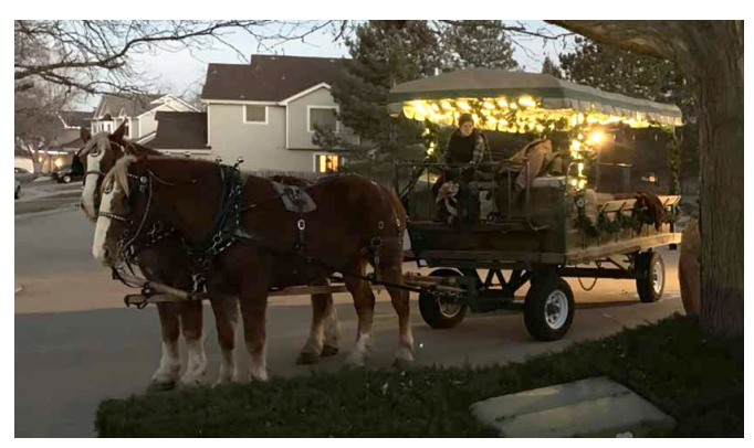
Holiday revelers enjoyed the hayride and cookie exchange.

We often do not know what will be discussed at our meeting until shortly before. Our agendas and meeting minutes are posted on our website prior to court meeting and should contain more up-to-date information. You can also contact Management Specialists with any questions regarding upcoming or prior issues.